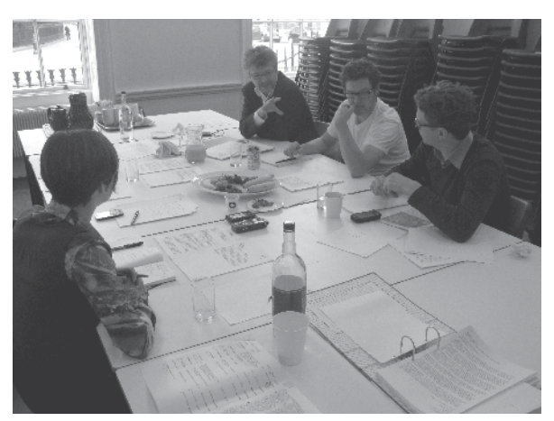
Review Board meeting, April 2010