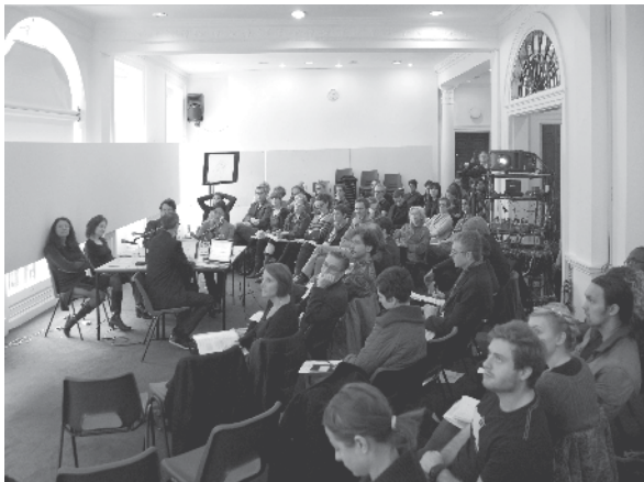
Symposium, October 2010

or 'anthropological space' and 'geometrical space' (Merleau Ponty), between a defined form/figure and the dynamics of social and perceptional space, this ever-evolving field of activity, inhabitation and experience?